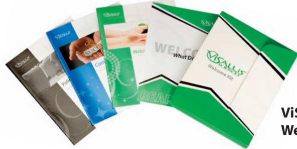
ViSalus Welcome Kit